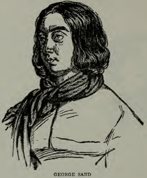
In 1832. From a lithograph by Jullien.

accessible to draughtsmen, sketchers, and photographers, her icons multiplied indefinitely for a period of over fifty years. We do not profess to treat of these exhaustively, but they certainly exceed some three hundred in number, if we may judge by such as are